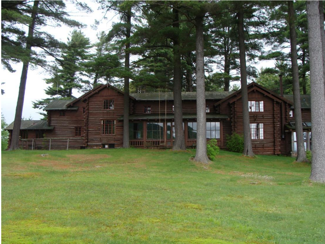
Debar Lodge, south side