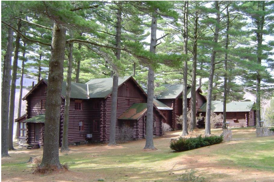
Debar Lodge, north side

The buildings of the Debar Lodge complex have changed little since the 1979 acquisition. In addition to the lodge, five other structures from the Wheeler era remain standing in the complex, all in varying states of repair. A horse barn located northeast of the lodge, and a woodshed/storage building located at the entrance to the complex, were constructed by the lessee during his term on the property. No standing structures from the Schroeder tenancy on the property remain. The remnants of a carriage road system are obvious on some of the lands around Debar Lodge. The air strip built by